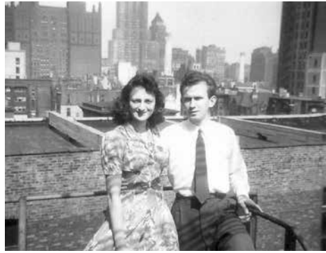
Chicago, Illinois, 1942